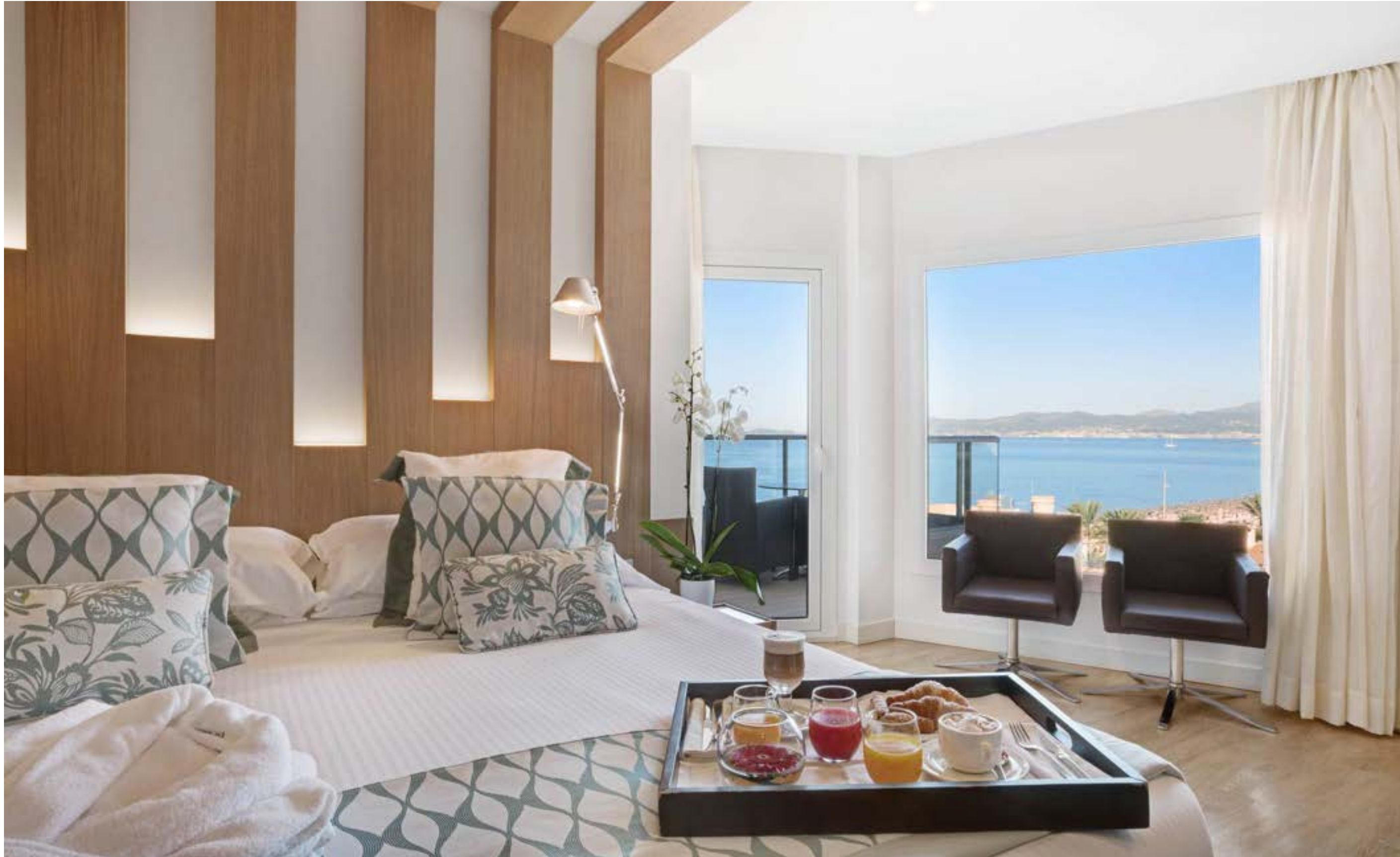
Picture: Premium Side Sea View